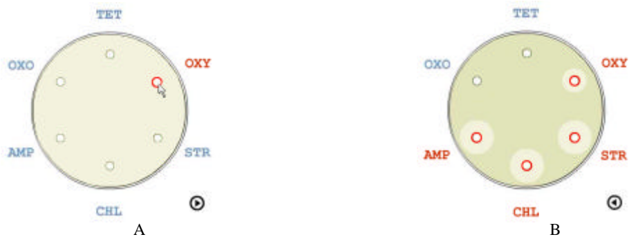
Fig. 3: Antibiotic Susceptibility Test input form (A empty - B partially filled)

Due to the intrinsic visual nature of this testing we decided to develop a program with Macromedia Flash MX®, which resembles the dishes used in the experiments. Flash is an excellent tool for interactive application development in internet. It uses vector graphics, everything you see on your screen is displayed by a mathematical calculation, meaning that a Flash movie can stretch to fit any resolution and still look good (as long as you don't have any raster graphics such as jpegs in it), which has always been a huge barrier for HTML. Each antibiotic (white circles) becomes a button. Once it is clicked it changes its colour to red and the user is asked to insert growth diameter and other data about the testing. When all data have been inserted and stored into database, the image will change to show the growth inhibition diameters previously inserted.